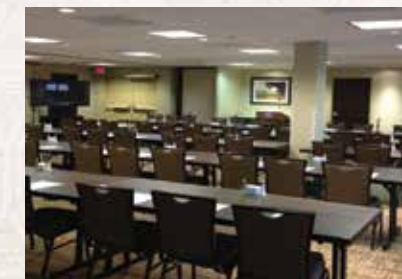
MEETING ROOM 2 This room is ideal for rehearsal dinners and receptions.