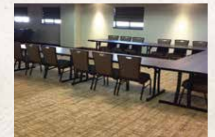
MEETING ROOM 3 This room is ideal for rehearsal dinners.