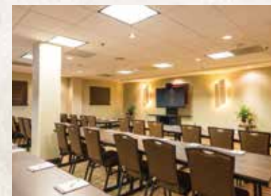
MEETING ROOM 1 This room is ideal for rehearsal dinners and receptions.